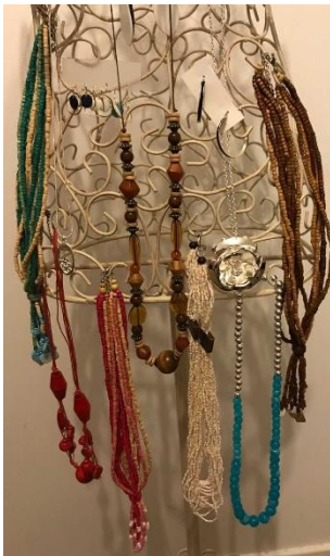
Assorted Jewellery pieces $1 each