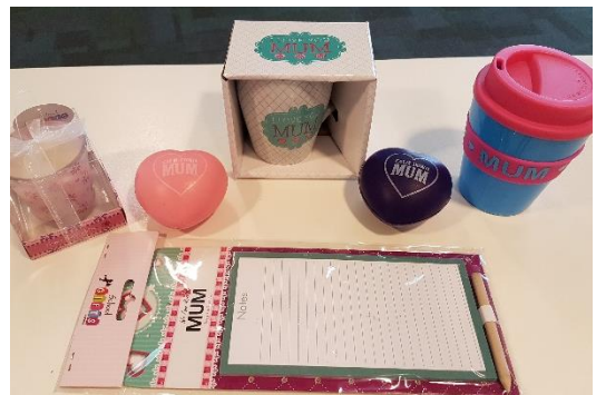
Various Mother's Day items $2-$5